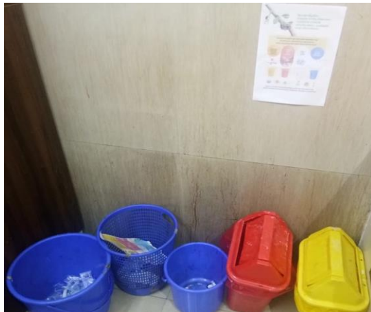
Palmshade Hospital, Ponnad