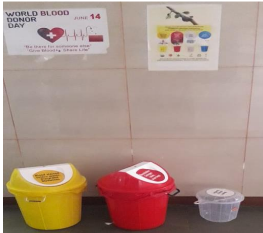
Initiatives Done by Sacred Heart Hospital, Cherthala