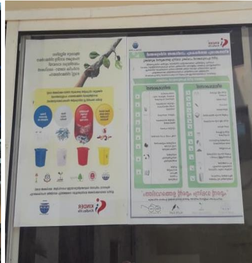
Initiatives Done by Kinder Hospital, Cherthala