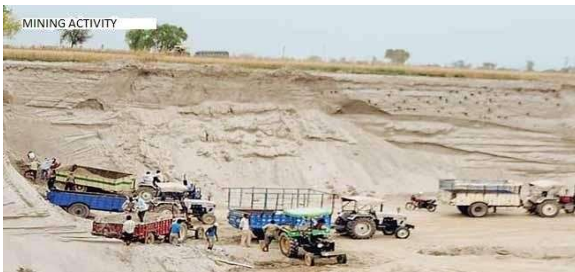
Overview of Mining Activity

In Compliance to the Notification Issued by the Ministry of Environment, Forest and Climate Change Dated 15.01.2016, the preparation of District survey report of River bed mining and other minor minerals is in accordance appendix 10 of the notification. It is also mentioned here that the procedure of preparation of District Survey Report is as per notification guidelines. Every efforts have been made to cover sand mining locations, areas & overview of Mining activity in the district with all it's relevant features pertaining to geology & mineral wealth in replenish able and non-replenish able areas of rivers, stream and other sand sources. This report will be a model and guiding document which is a compendium of available mineral resources, geographical set up, environmental and ecological set up of the District and is based on data of various departments, published reports, and websites. The data may vary due to flood, heavy rains and other natural calamities. Therefore, it is recommended that Sub Divisional Level Committee may take into consideration all its relevant aspects / data while scrutinizing and recommending the application for EC to the concerned Authority.