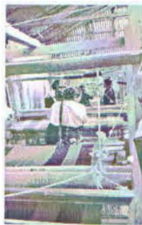
:-tul..hap I landloom&I landicraft Co-operative Society Ltd Work-Shop