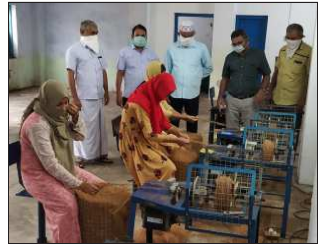
A view from the Coir production centre, Chetlat.

The Coir Production Centre, Chetlat was established during the year 1982 and subsequently the unit has been closed during 2013 consequent on the absorption of all labours