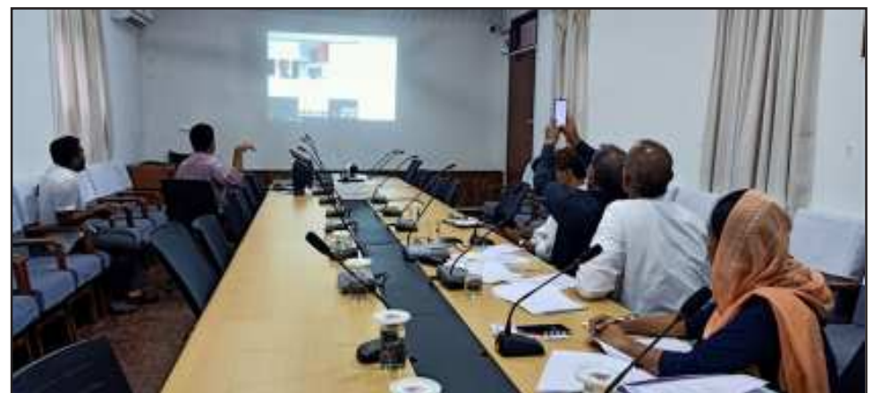
A view from pre-bid meeting conducted by NIC through Video conference for Directorate Medical Health Services.

Kavaratti : NIC Lakshadweep upheld department of Medical and Health Services, Kavaratti, Lakshadweep to conduct pre-bid meeting of supply, installation and commissioning of 1.5 T MRI scanner on 14 th July, 2020 through NIC Video conference facility.