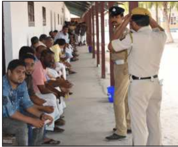
General Election 2019 : Views of Election process at Kavaratti Island held on 11 th April 2019.

Kavaratti : The polling in Lakshadweep was held on 11.04.2019 in all 10 inhabited Islands. Total of 55057 was the eligible voter for electing a representative to the House of People from