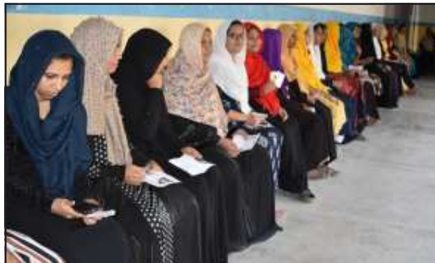
തലസ്ഥാന ദ്വീപിലെ വിവിധ ബൂത്തുകളിൽ വോട്ട് ചെയ്യാനെത്തിയ പുരുഷന്മാരുടെയും സ്ത്രീകളുടെയും ദൃശ്യം.

കവരത്തി : 17-ാം ലോകസഭയിലേക്ക് നടന്ന ഒന്നാംഘട്ട വോട്ടെടുപ്പിൽ രാജ്യത്തെ ഏറ്റവും ചെറിയ ലോകസഭാ നിയോജകമണ്ഡലമായ ലക്ഷദ്വീപിൽ കനത്ത പോളിംഗ് നടന്നു. 85.14 ശതമാനം പോളിംഗാണ് ലക്ഷദ്വീപിൽ രേഖപ്പെടുത്തിയത്. രാവിലെ 7 മണിക്ക് വോട്ടെടുപ്പ് ആരംഭിച്ചത്. വളരെ നേരത്തെ തന്നെ ജനങ്ങൾ ആവേശത്തോടെ പോളിംഗ് ബൂത്തിലെത്തി തങ്ങളുടെ സമ്മതിദാനാവകാശം വിനിയോഗിച്ചു. പോളിംഗ് ബൂത്തുകൾക്കു മുമ്പിൽ രാവിലെ തന്നെ സ്ത്രീകളുടേയും പുരുഷന്മാരുടേയും നീണ്ട നിരകാണാമായിരുന്നു. പുരുഷന്മാർ 83.45 ശതമാനം വോട്ട് രേഖപ്പെടുത്തിയപ്പോൾ