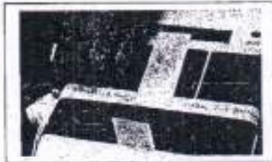
Sealing outer Result Section with Address Tag