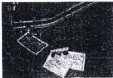
Sealing of Drop Box of VVPAT with Address Tag

2. Seal the drop box of VVPAT with Address Tag and ask polling agents also to sign it.