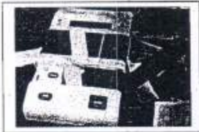
Fixing Green Paper Seal

1. Seal the CU with Green Paper Seal, Special Tag, Address Tag and Outer Paper Strip Seal (ABCD seal) and obtain signatures of polling agents on them.