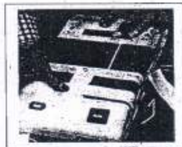
Sealing with Outer Paper Strip Seal (ABCD Seal)

2. Seal the drop box of VVPAT with Address Tag and ask polling agents also to sign it.