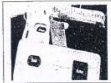
Sealing inner Result Section with Special Tag