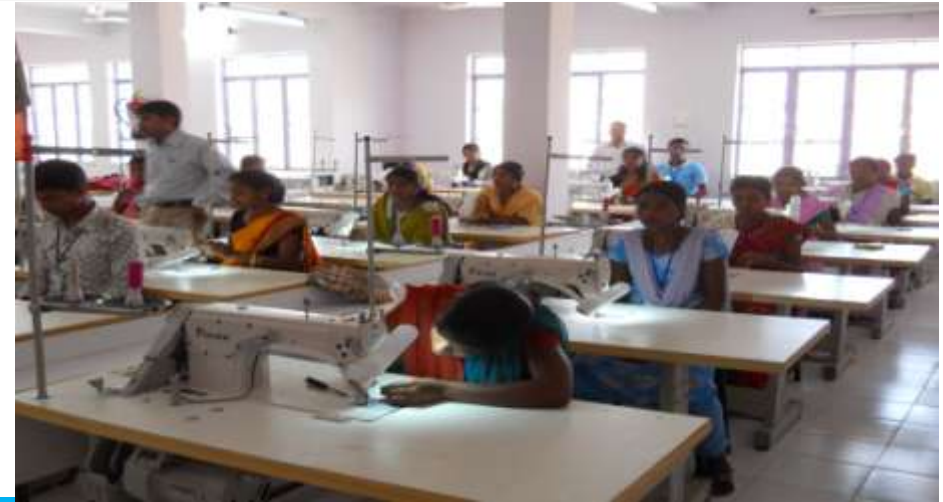
Training at Gumla