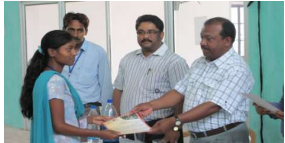
Counseling, award of certificate and departure for placement