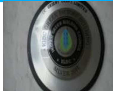
Award of the factory