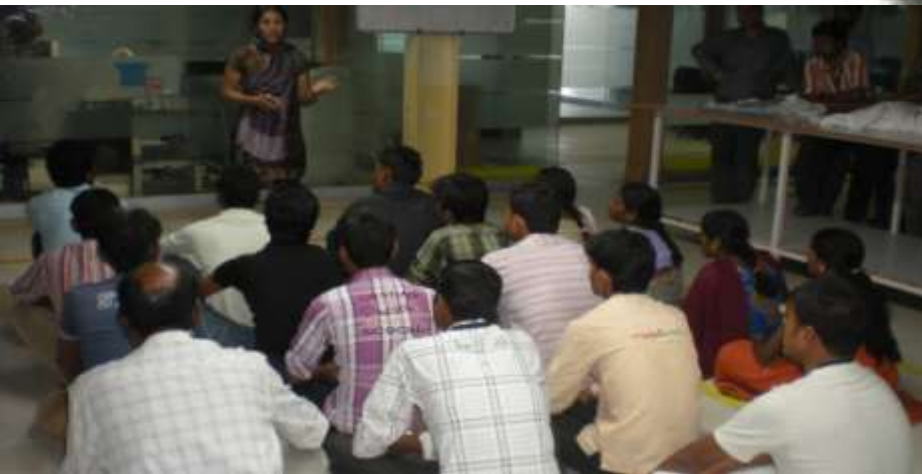
Welfare officer at the factory orienting the trainees