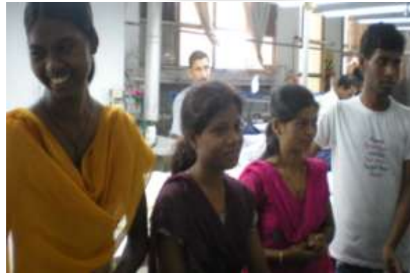
GUMLA GIRLS CONSIDERED BEST AT THEIR WORK