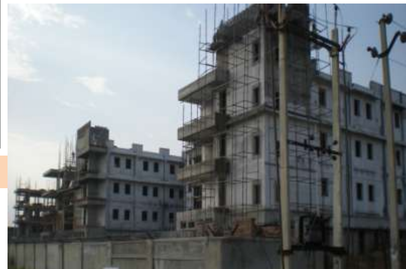
Upcoming Girls Hostel, 1500 capacity