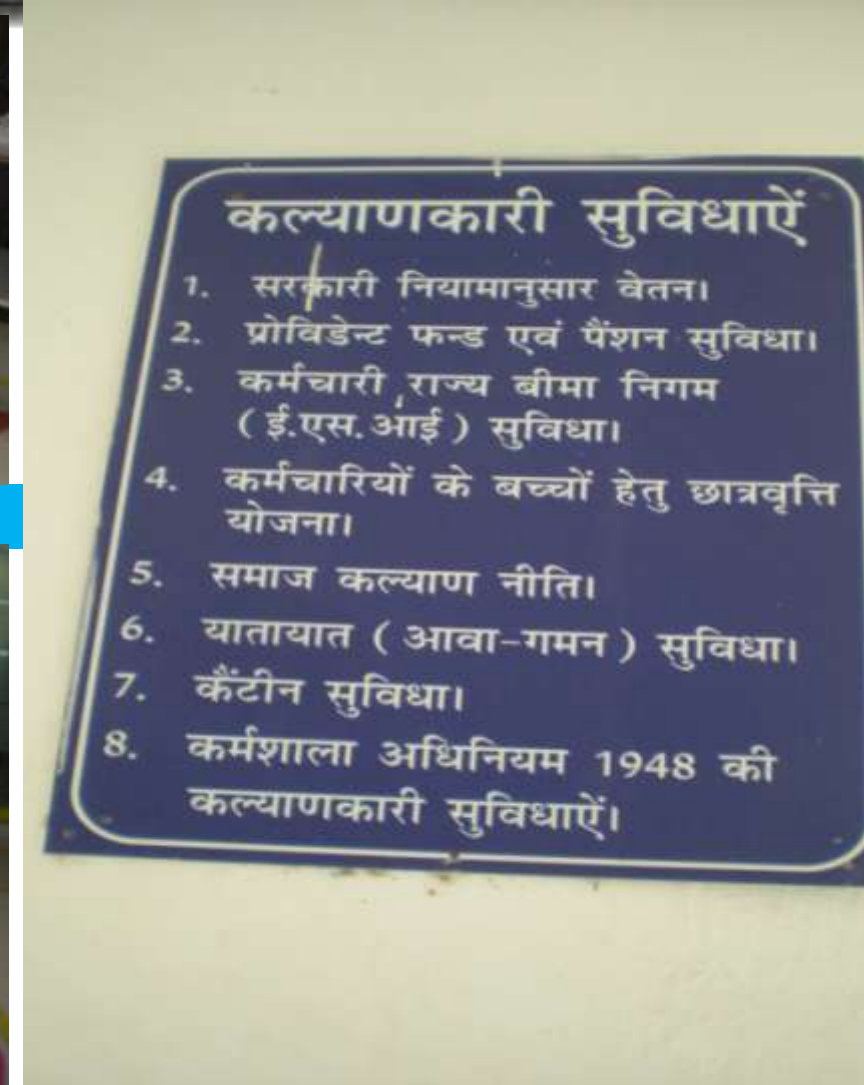
Facilities of the industry