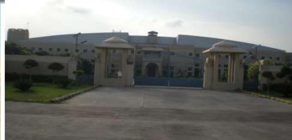
Factory at Chaupanki, Rajasthan